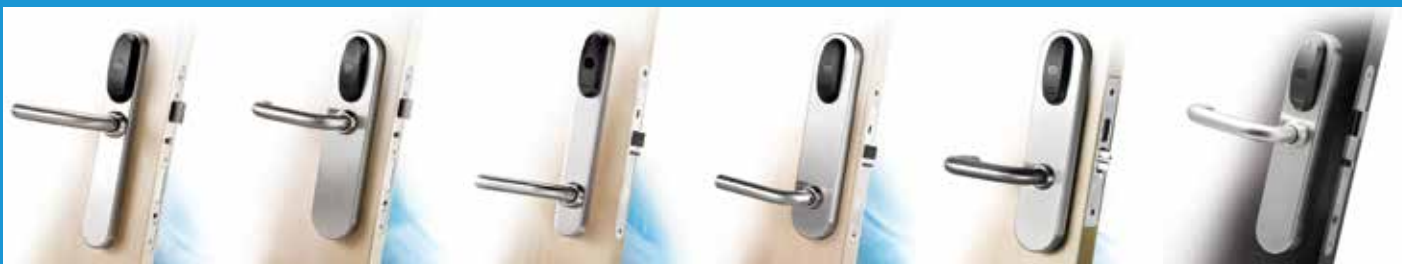
European narrow body escutcheons

The finish of BioCote® treated escutcheons differs slightly from that of standard finish escutcheons due to the mix of lacquer and silver ion particles. The finish is long-lasting and maintains its antimicrobial performance over the expected lifetime of the escutcheon.