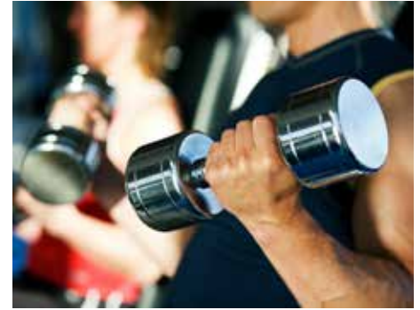
leisure - gym