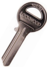
Lockwood Override Key