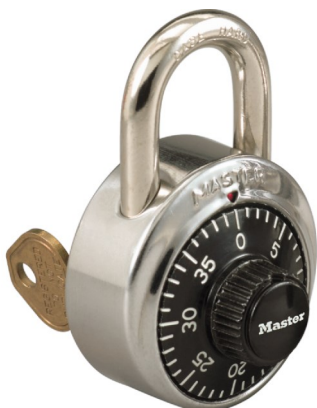
Master 1525 Key Override Padlock