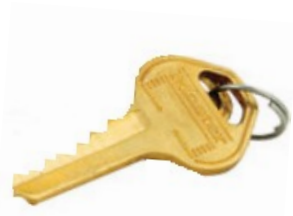
Master 1525 Override Key